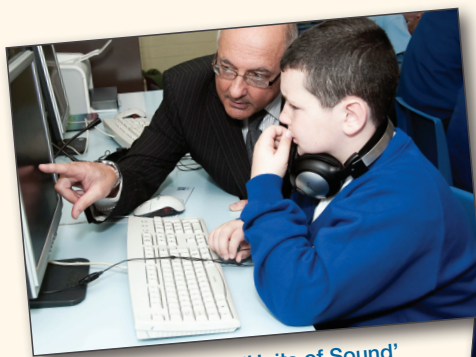
Pupil using 'Units of Sound'

The biggest impact was the reading gains made by the children in the lowest 20%. Almost half of these children moved from the 'Below Average' to the 'Average category' in reading in just two school terms.